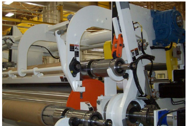
Servo Positioned Primary Arms and Transfer Knife System