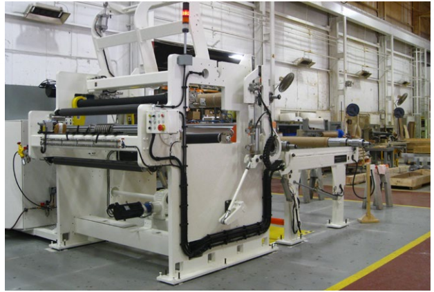
SurfaStart 1000 Winder