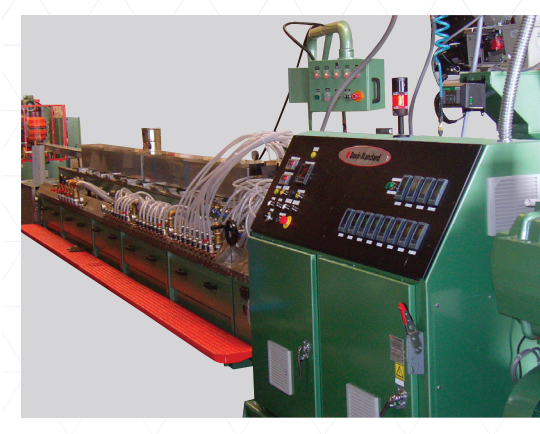
Conical Swin Screw Extruder