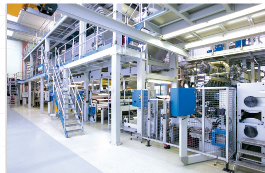
Extrusion Coating Systems