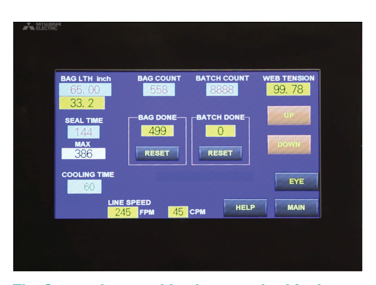
The Gamma bag machine is recognized for its ease of use and fast run rate.