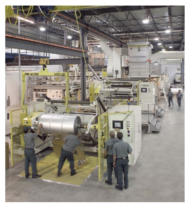
Flexible Packaging Line