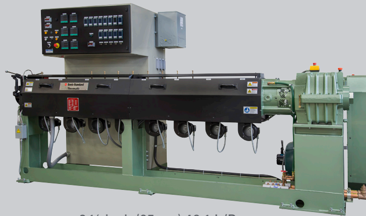
2 ½ inch (65mm) 48:1 L/D