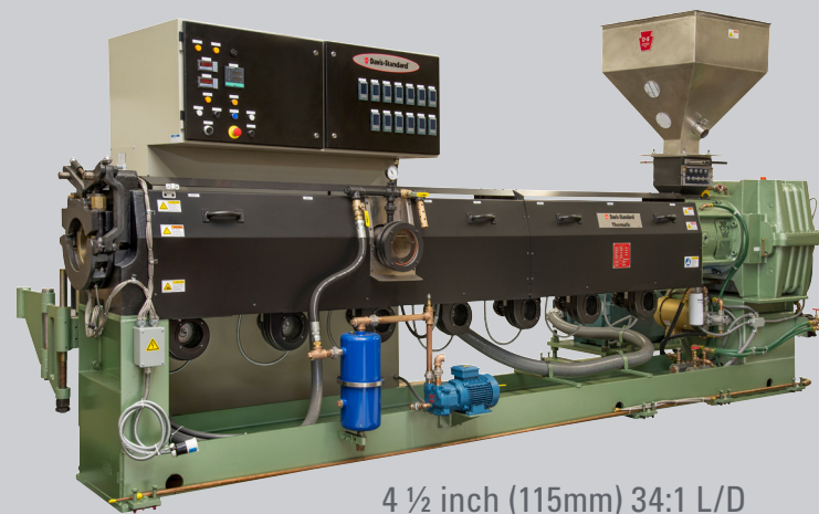
4 ½ inch (115mm) 34:1 L/D Vented Air-Cooled Thematic®