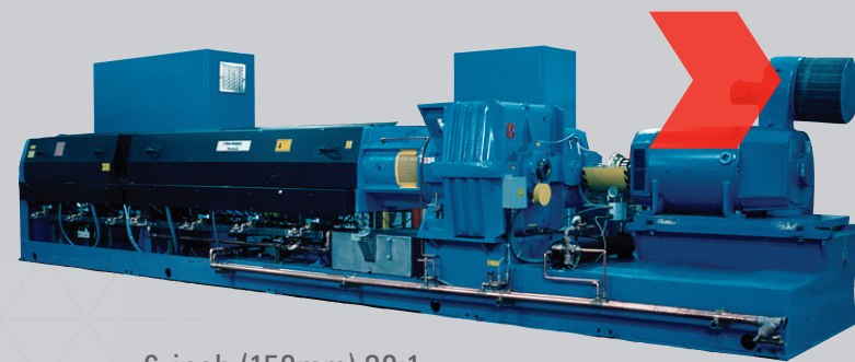
6-inch (150mm) 30:1 Water-Cooled Thematic®