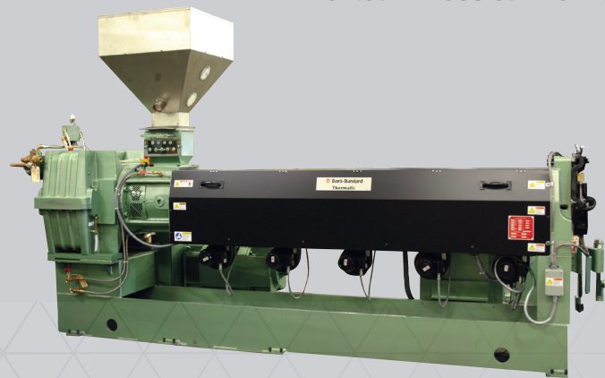
3 1/2-inch (90mm) 30:1 Air-Cooled Thematic®