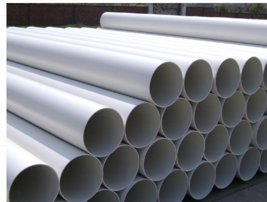
Small Walled Pipe