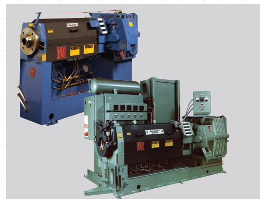
Smooth Barrel Extruders