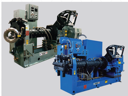
Pin Barrel Extruders