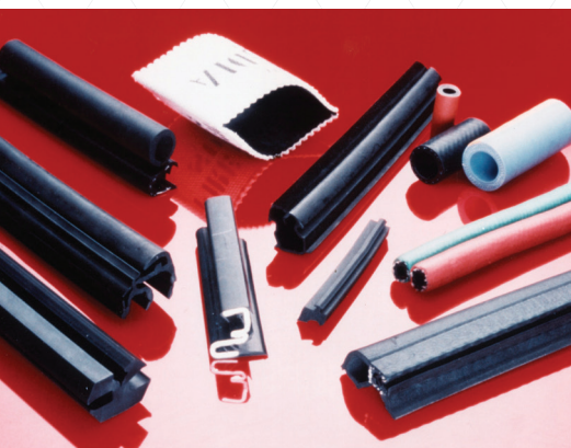
Elastomer Product Samples