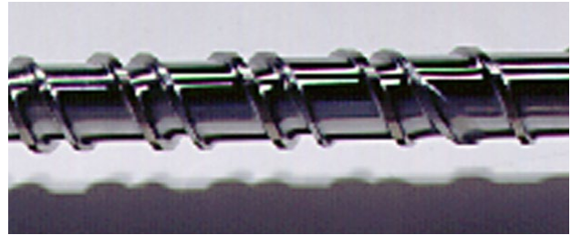
Davis-Standard's patented barrier screw design provides low shear processing with uniform shear history. The result? Excellent performance with metallocene resins, output stability, melt quality and profile stability.