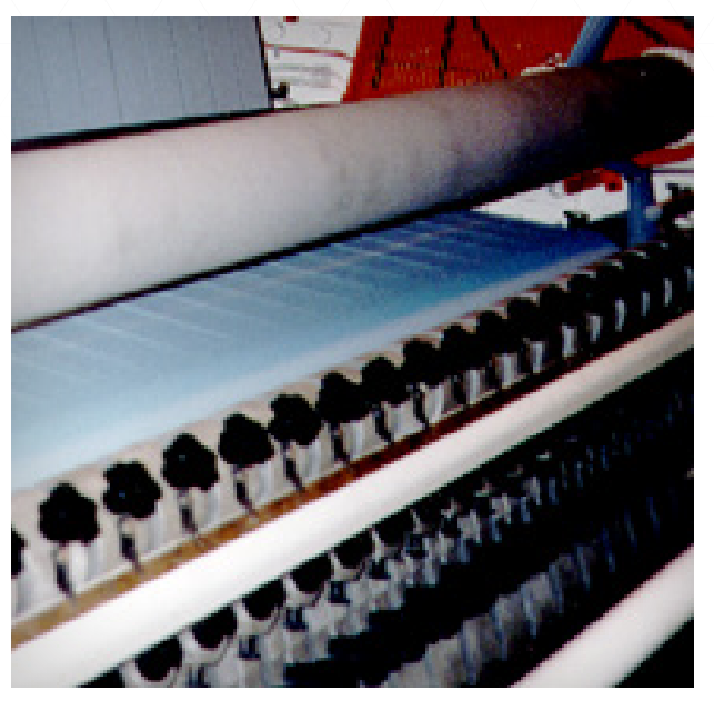
Davis-Standard's embossed film lines can in-line slit down to 2.5" (64mm) without bleed trim