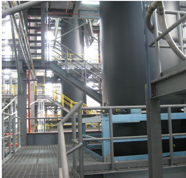
7-Layer Agricultural Film Production