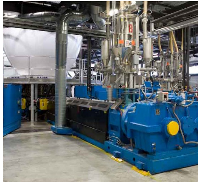
20 Meter Bubble