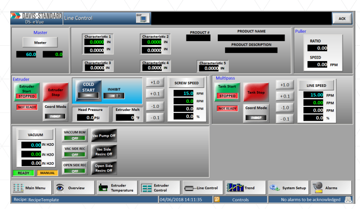
Ds-eVue Line Control Screen